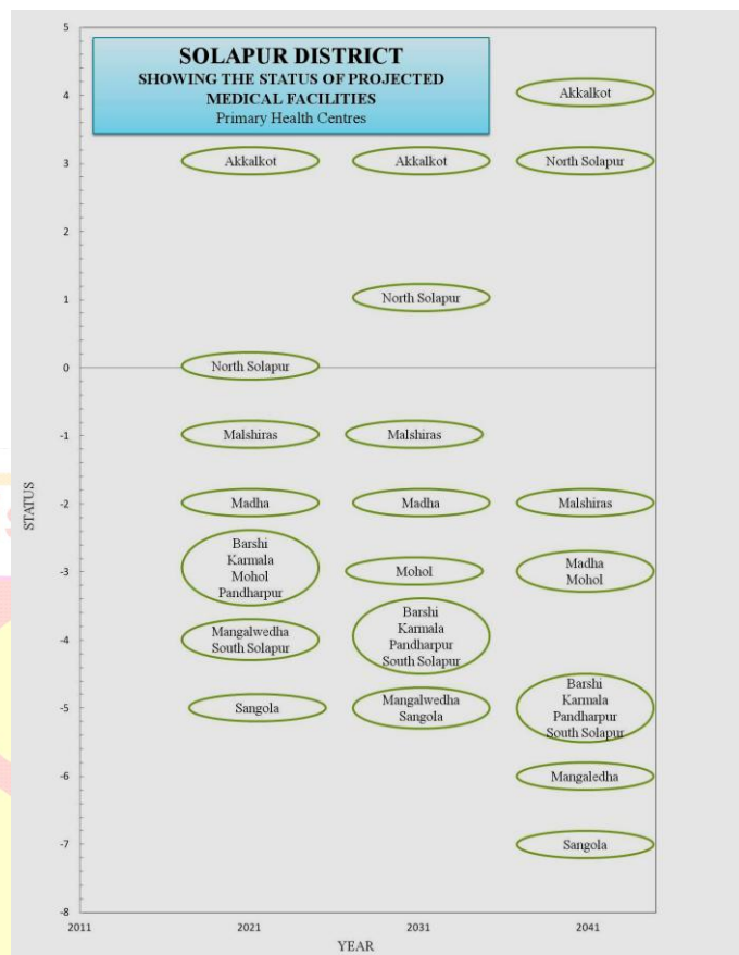
Solapur District: Existed and Projected Health Care Facility PRIMARY HEALTH CENTRE

Fig. no 8.2 depicts the probable addition of PHCS in the rural areas in the district. It shows that all districts are indefinite in the year 2021 and the condition will remain constant in the future except Akkalkot tahsil. All other tahsil is far depicting. So allotting new PHCs, more attention should be given this tahsils. North Solapur tahsil only one tahsil in the year 2021 there is no required single PHC.